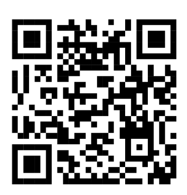
Financial Statement 2023